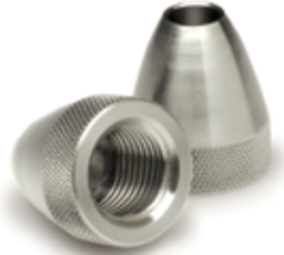
D-NUT-18 Mixing Tube Clamp Nut