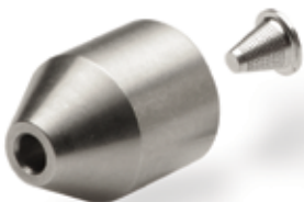
MA-FIL-03 Diamond Guard Assembly