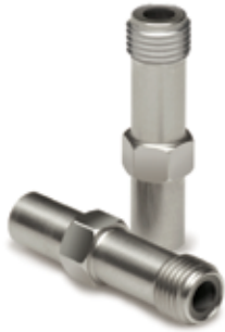
DA-ABR-01 Abrasive Inlet

With the newly enhanced SLICE2, it is now possible to order the cutting head configurations and accessories perfect for your operation. SLICE2's ability to adapt to an even wider range of waterjet systems worldwide allows for greater versatility in ordering and ensures the cutting head will meet your specific needs.