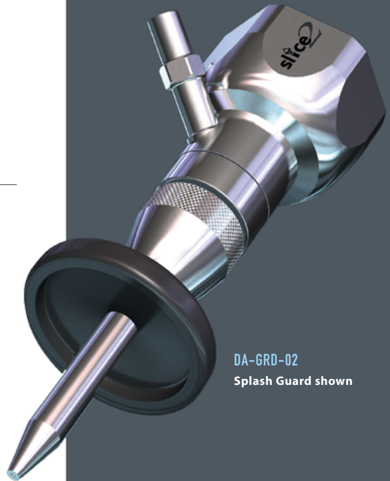
DA-GRD-02 Splash Guard shown