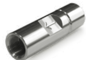
M-HOU-02 3/8"F to 3/8"F Diamond Guard Filter Inline Housing