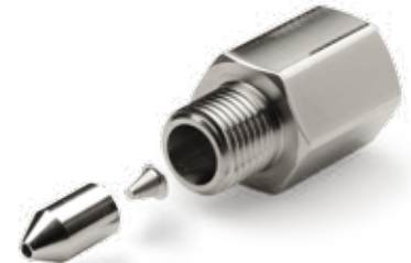
MA-FIL-09 M16 F to M16 M Diamond Guard Filter METRIC M16-1.5 Threads