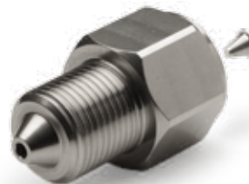
MA-FIL-02 3/8"F to 3/8"M Diamond Guard Filter Assembly MA-FIL-02NF 3/8"F to 3/8"M DGF Body (No Filter)