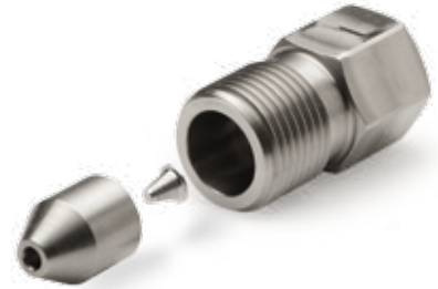
MA-FIL-07 1/4"F to 3/8"M Diamond Guard Filter Assembly