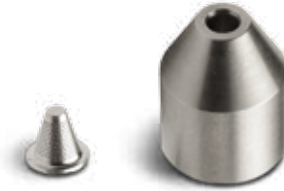
M-FIL-01 3/8" Diamond Guard Filter M-ADP-06 3/8" Diamond Guard Insert