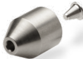
MA-FIL-03 3/8" Diamond Guard Filter & Insert Combo